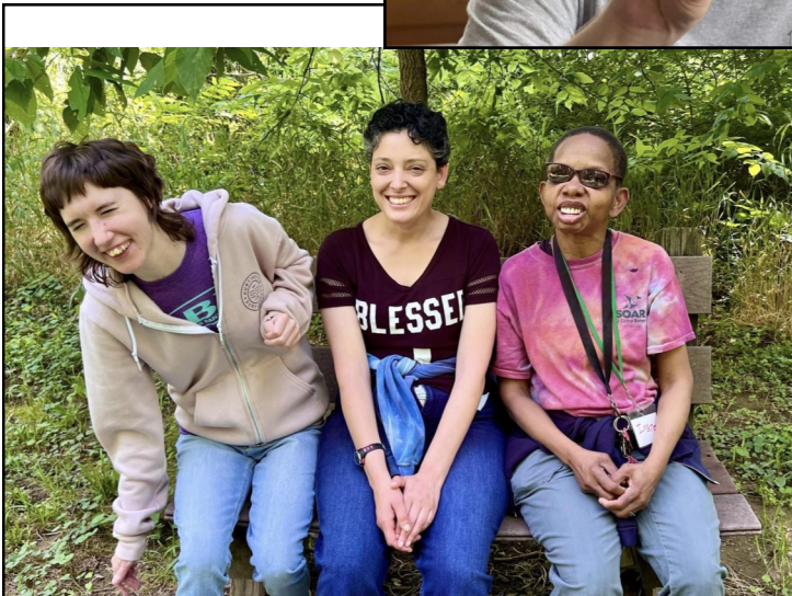
Friends at Blandly Farms