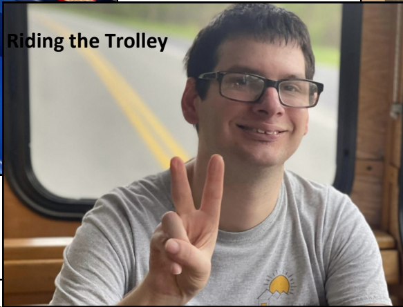
Riding the Trolley