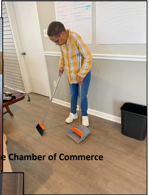
Volunteering at the Chamber of Commerce